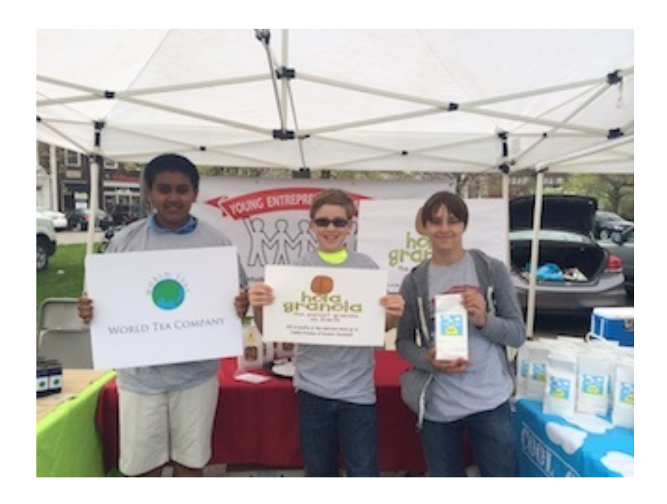
University School middle school entrepreneurs sell their loose leaf tea, breakfast granola, and cake mixes.