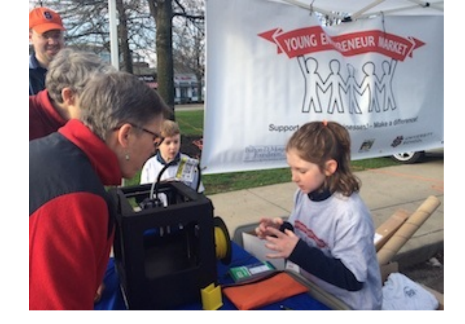
A Young Innovators' Society member explains to market shoppers how a 3D printer works.