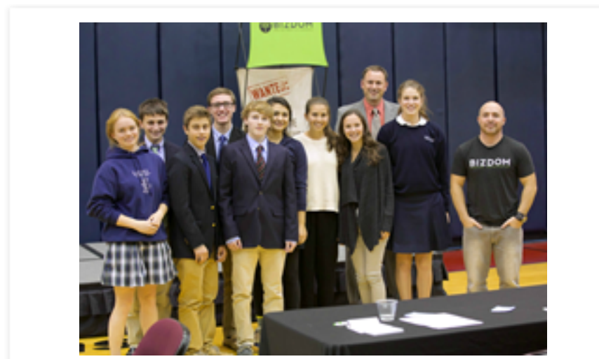
Pitchfest's winning team of students

“Sparking the interest of young talent in Northeast Ohio and positioning the area as a vibrant place for starting and growing businesses are critical to the region's future.”